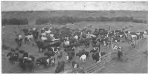
A CATTLE RANCH NEAR OBERLIN.